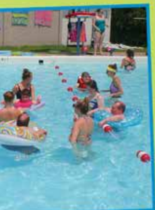
TO THE POOL