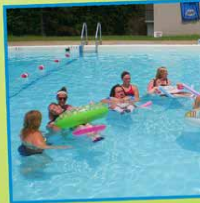
EVERYONE LOOKS FORWARD