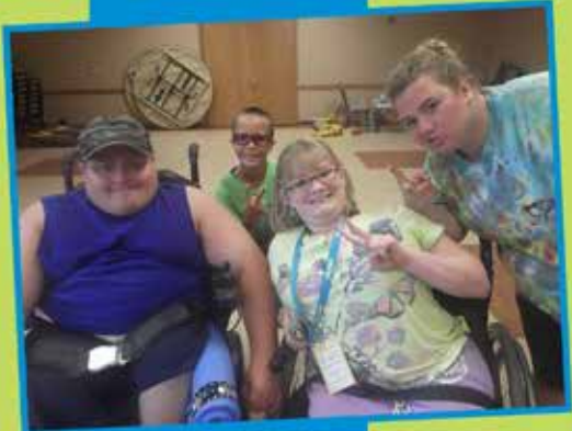
HAVING FUN WITH FRIENDS