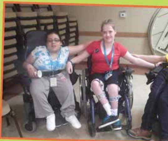
IT'S ALWAYS NICE TO REUNITE WITH FRIENDS