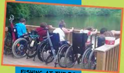
FISHING AT THE POND