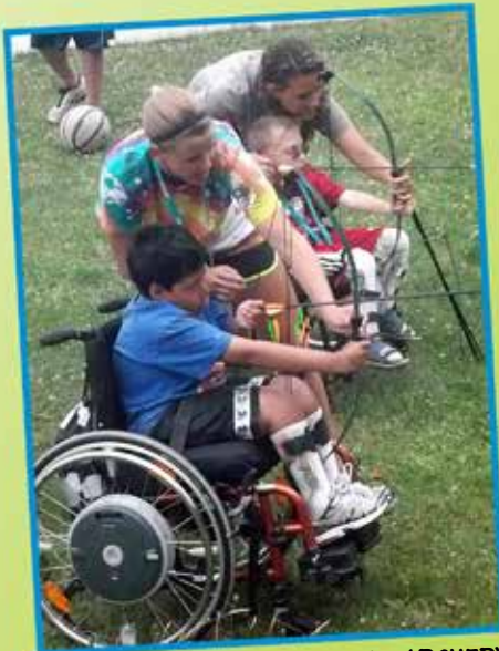
GETTING BULLS EYES DURING ARCHERY