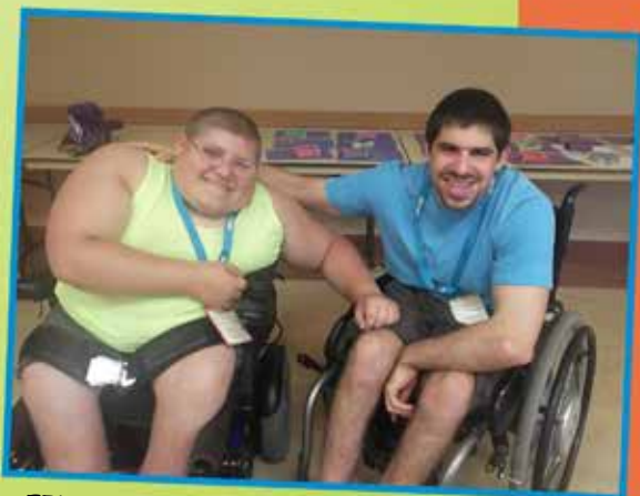
FRIENDS HANGING OUT IN BETWEEN ACTIVITIES