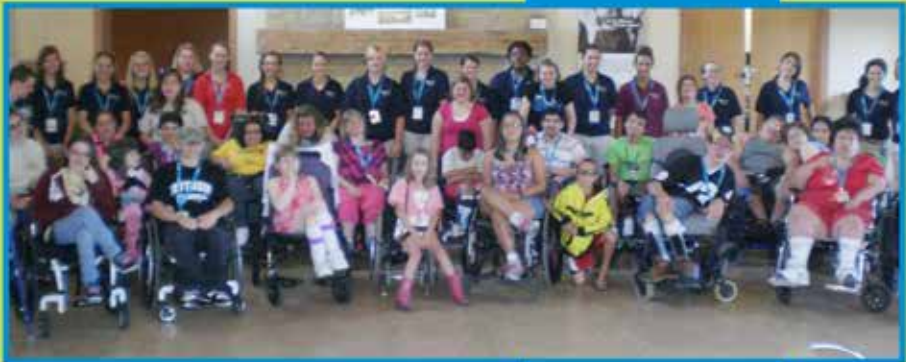
YOUTH AND TEEN TOGETHER FOR A PICTURE