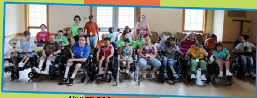
ADULTS POSE FOR A PICTURE