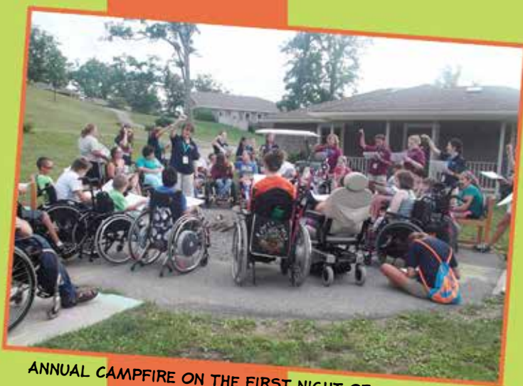
ANNUAL CAMPFIRE ON THE FIRST NIGHT OF CAMP