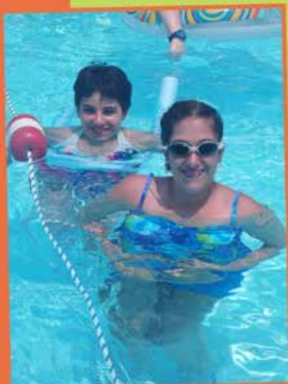
STAYING COOL IN THE POOL