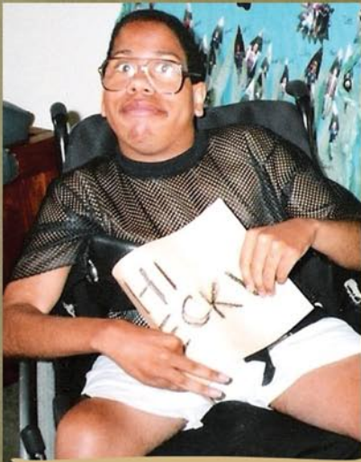
BJ Glass 1980-2010